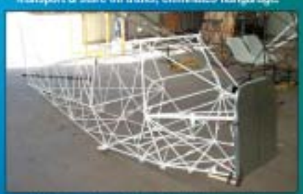
Safe conventional fully welded chrom-moly construction. Short build time, fast build kit included in the price.