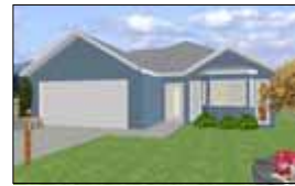
Lot 7, Prospect Heights, Eaglehawk - $295,500