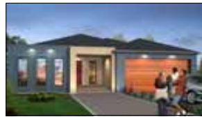
Lot 3, Prospect Heights, Eaglehawk - $295,500