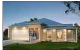
18 Bowles Rd, Epsom - $307,500