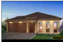
Lot 33, Ascot Park, Epsom - $305,800