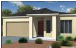
Lot 53, Irontree Close, Kangaroo Flat - $324,300