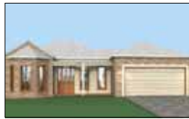
Lot 1, Watson Ave, Eaglehawk - $260,000