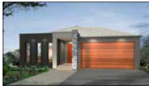
Lot 28, Ascot Park, Epsom - $285,500