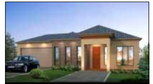
Lot 33, Irontree Close, Kangaroo Flat - $304,800