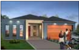
Lot 21, Ascot Park, Epsom - $299,000

Please click on the images below to view the packages available: